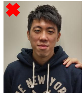
Not one person