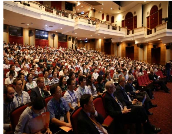
Academics and professionals