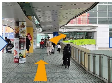
Walk across the bridge and enter the shopping mall