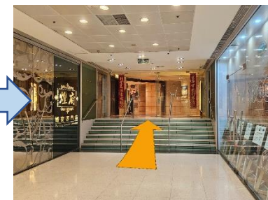
You will see the entrance of the hotel