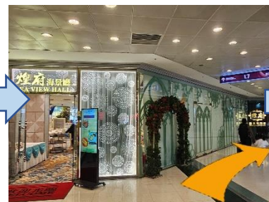
Keep walking until you see "Sea View Hall Restaurant", turn right