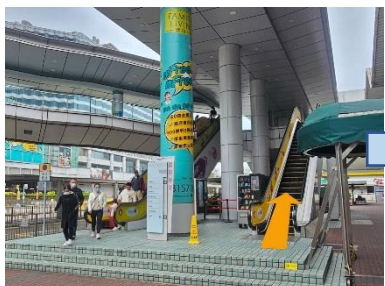
Exit from Hung Hom Exit C2, take this escalator