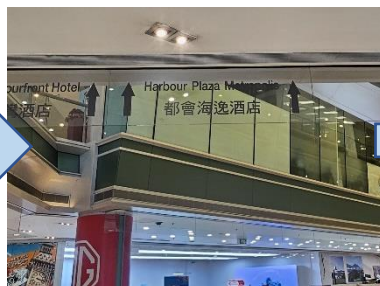
Turn right and you will see the signage to the hotel