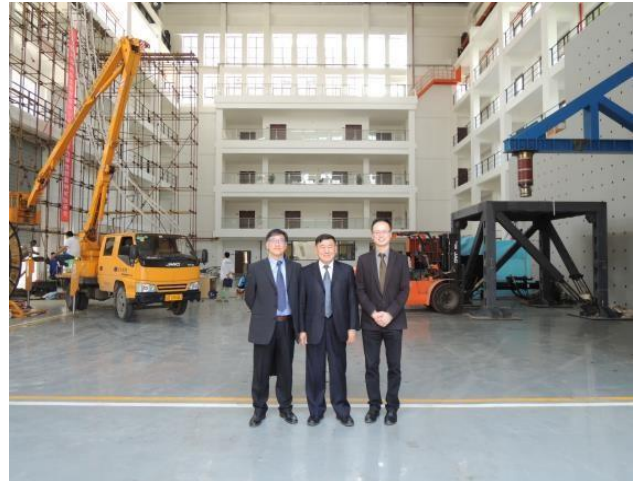
Experimental Center of Civil Engineering