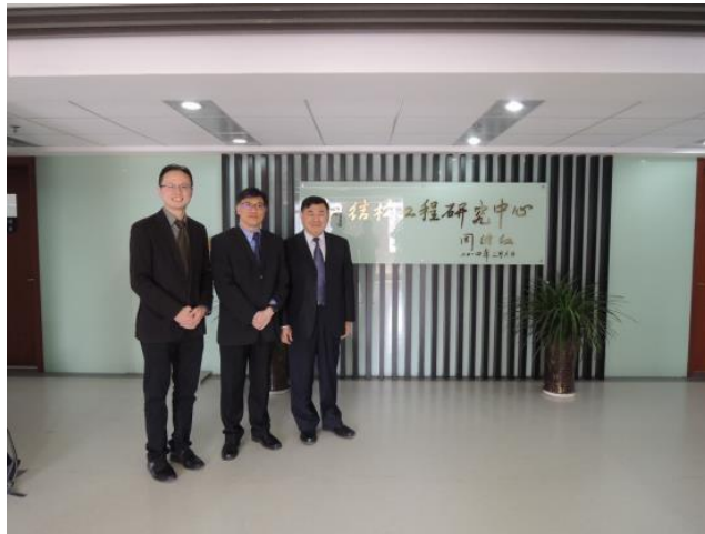
Research Center for Steel Structure Engineering