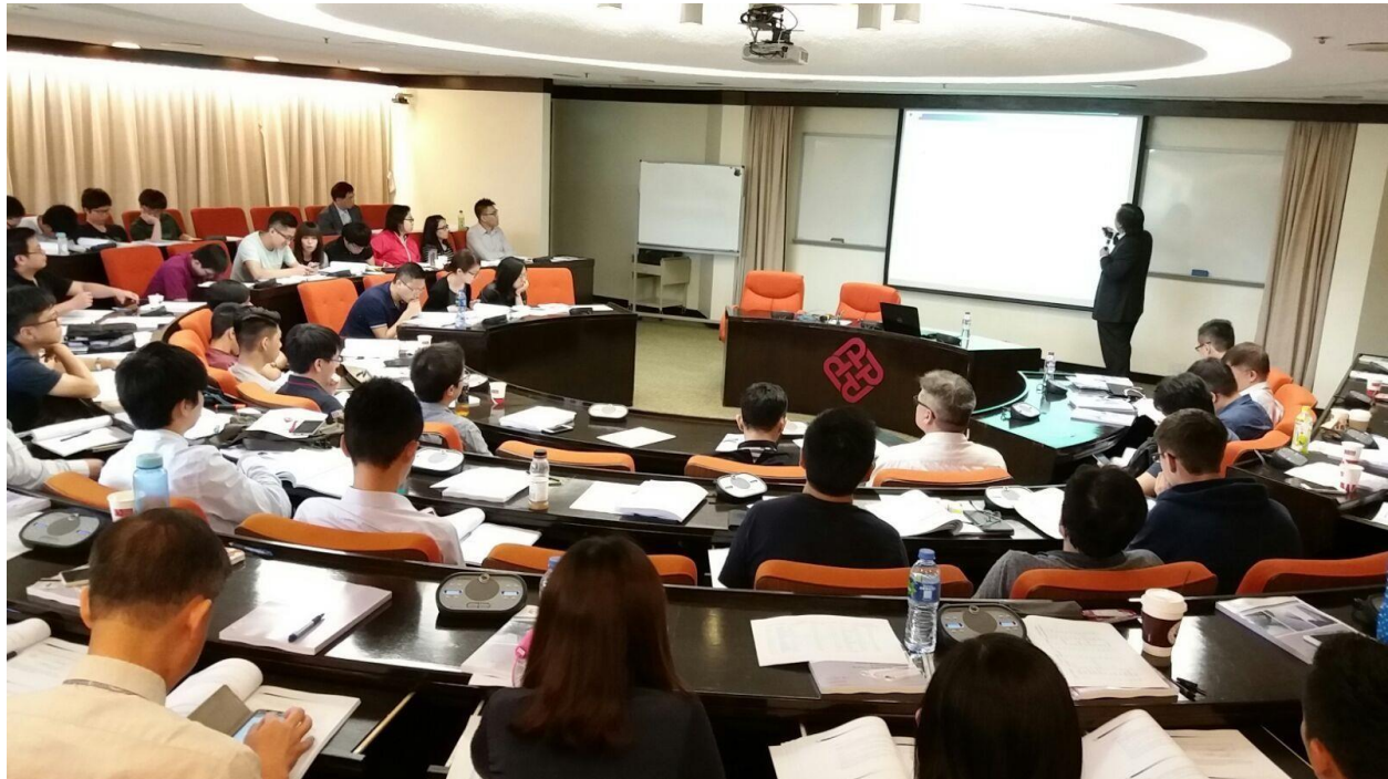
A full house of 78 delegates had attended the Technical Seminar.

A Technical Seminar on “ Effective Design and Construction to Structural Eurocodes: EN 1990 & 1991, EN 1992, EN 1993 and EN 1994 ” jointly organized by the Hong Kong Constructional Metal Structures Association (HKCMSA) and The Chinese National Engineering Research Centre for Steel Construction (Hong Kong Branch), The Hong Kong Polytechnic University (CNERC) was successfully held on 24 June 2016 with a total of 78 registrants attended.