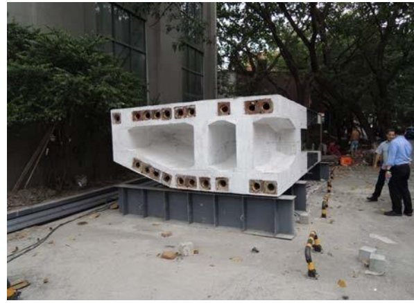
Delegation team at the Experimental Center of Civil Engineering.