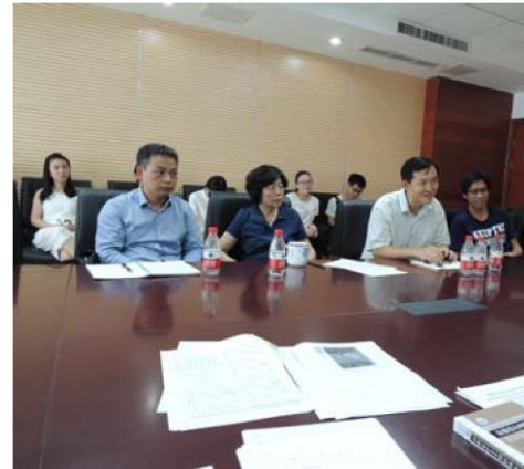
Discussion forum at the Research Centre for Steel Structures Engineering.

This visit paved the way for further research collaboration, and academic exchanges and mobility between two the CNERC and the CQU. The CNERC looked forward to work with the CQU through various joint-research projects.