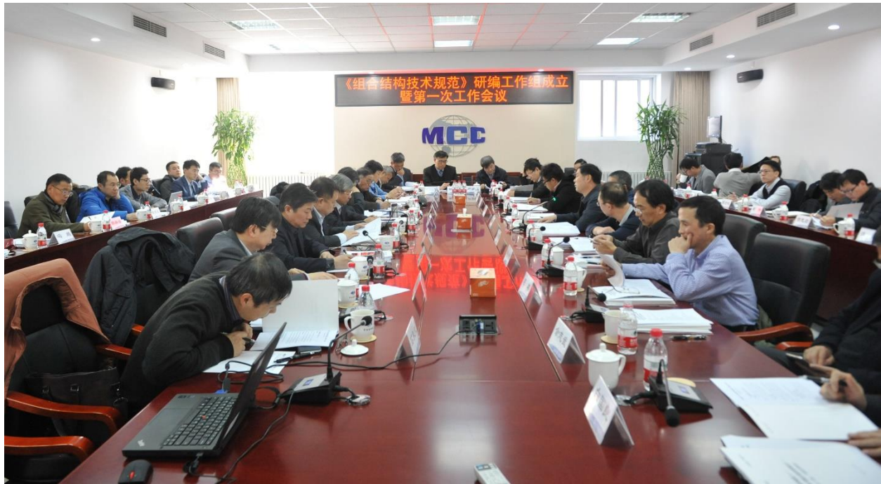
First Technical Committee Meeting in Beijing.