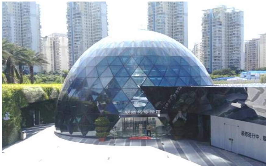
The State Steel Museum.

The CCSSC has established the first State Steel Museum. The Steel Museum is located in the Nanshan Houhai central district, adjacent to many of the world's top 500 corporate headquarters. The Steel Museum exhibits a brief history of the world's iron and steel metallurgical development, and explains in detail the development of the steel industry after the industrial revolution in the 19 th Century. The museum focuses on the history and technology of steel exhibits, and displays physical exhibits, models, photos, texts and multimedia, etc.; combines collection, exhibition, research, education, and communication in one; and connects science, academic, interest, and participation together, so to let the visitors understand the development of the world steel structures. The permanent exhibitions of the museum are located in the 2 nd level of the basement, and divided into 5 sections: prelude, steel structure history, steel structure technology, interactive area and 3D theater, which are open to the public and free of admission.