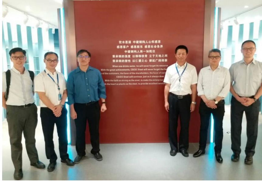
The CNERC delegation team visited the Steel Museum.