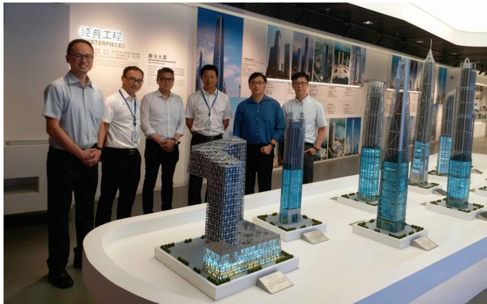
The CNERC delegation team visited the CCSSC Exhibition Hall.