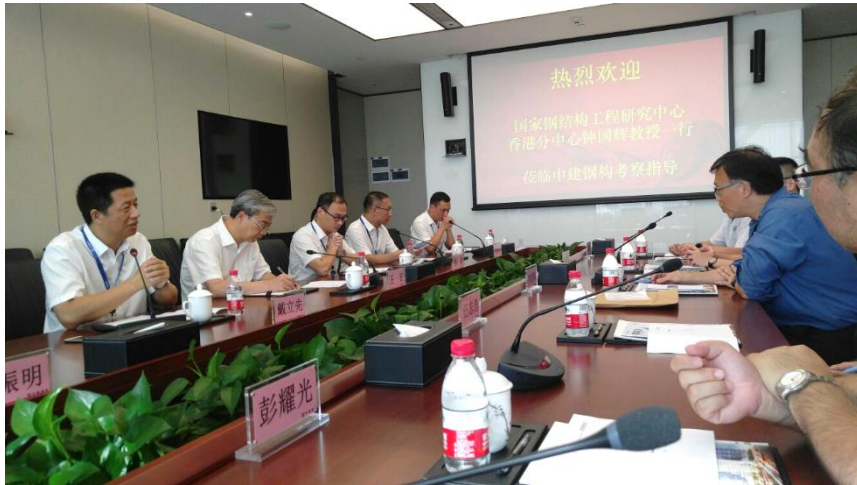
Meeting between the CNERC and the CCSSC.

On 14 August 2017, the CNERC delegation team visited the Headquarter of CCSSC, and warmly welcomed by the CCSSC.