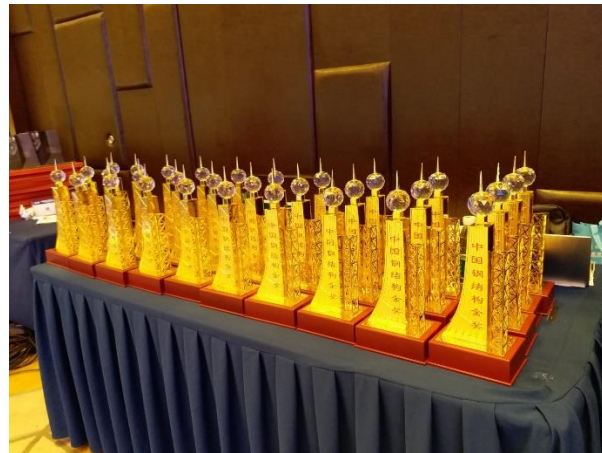
“Golden Structure Award” trophies of China Construction Metal Structure Association