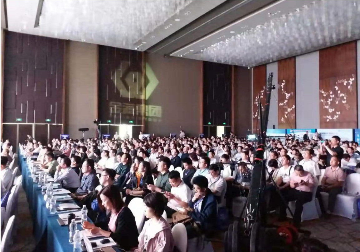
Chinese National Construction Steel Structure Industry Conference