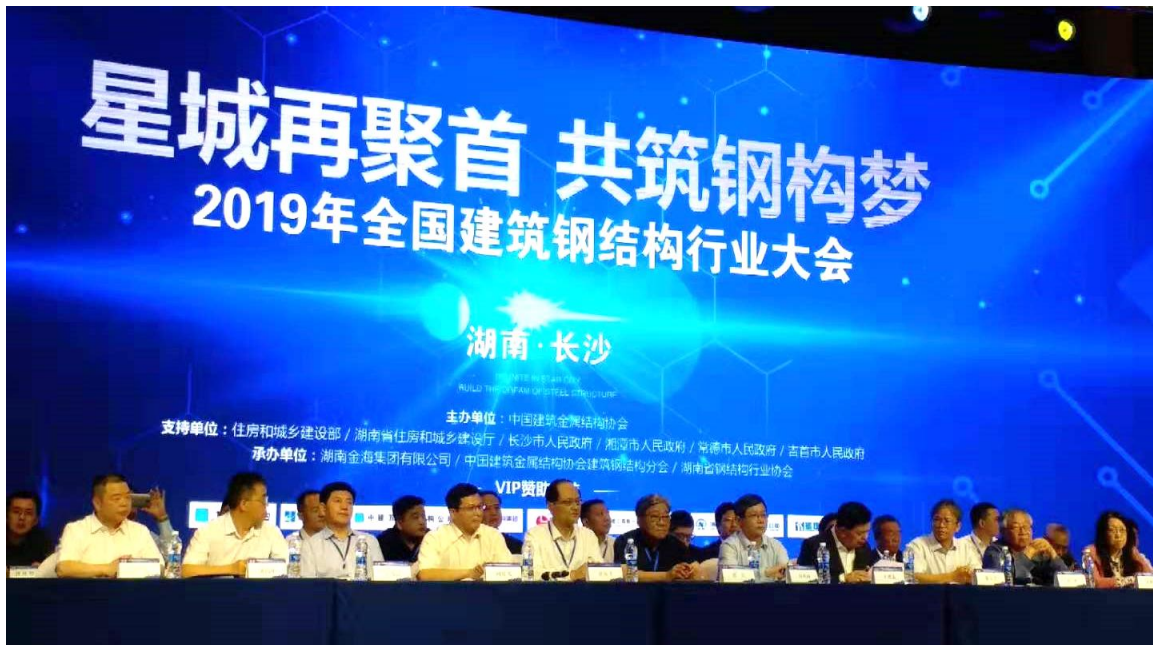
The Chinese National Construction Steel Structure Industry Conference

The content of the 3 rd Steel Structure Building Green Development Forum in 2019 included: