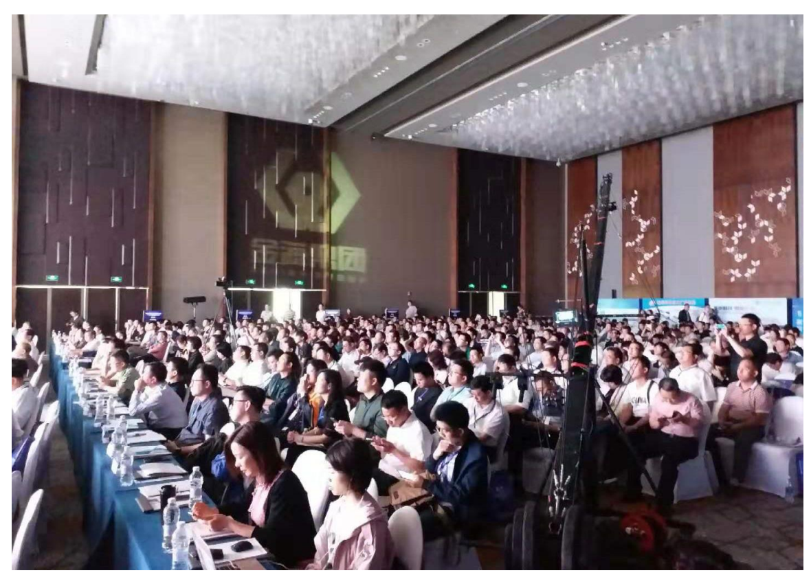
Chinese National Construction Steel Structure Industry Conference