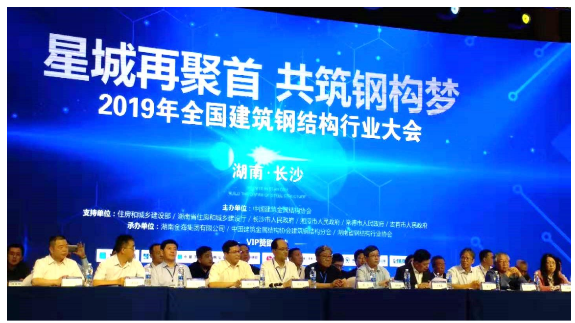
The Chinese National Construction Steel Structure Industry Conference

The content of the 3<sup>rd</sup> Steel Structure Building Green Development Forum in 2019 included: