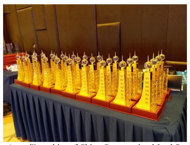
"Golden Structure Award" trophies of China Construction Metal Structure Association