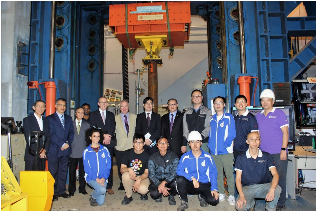
A photo taken at the Structural Engineering Research Laboratory at PolyU.

During the visit, the delegation team visited the Structural Engineering Research Laboratory at PolyU.