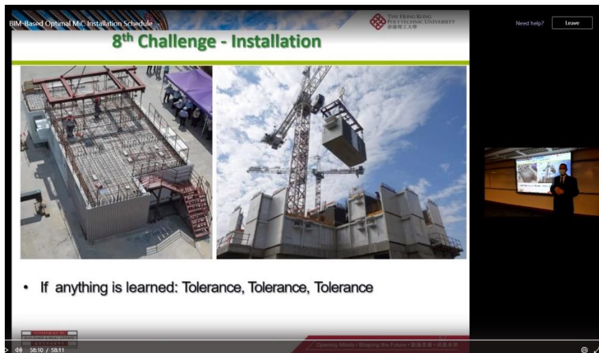
MiC webinar on “BIM-Based Optimal MiC Installation Schedule”.

The Housing Authority targeted to build 460,000 units in the coming ten years in order to reduce the gap between supply and demand in housing. This target is very challenging without the wide adoption of innovative construction solutions, such as Modular Integrated Construction (MiC). The prefabricated/precast components of buildings will not cope with such demand to meet the intended target. The MiC is a promising technology that will expedite the construction of building units, minimize interference to the adjacent services, facilities and businesses, as well as improve productivity and safety. However, the use of MiC also poses many challenges, particularly in Hong Kong weather conditions and environment, which add more challenges to the design of MiC module connections and alignment, the construction sequence, and the optimal crane location. The impact of several factors on MiC operation scheduling will be discussed. Lessons learned from other countries, such as mainland China, Singapore and North America, will also be presented.