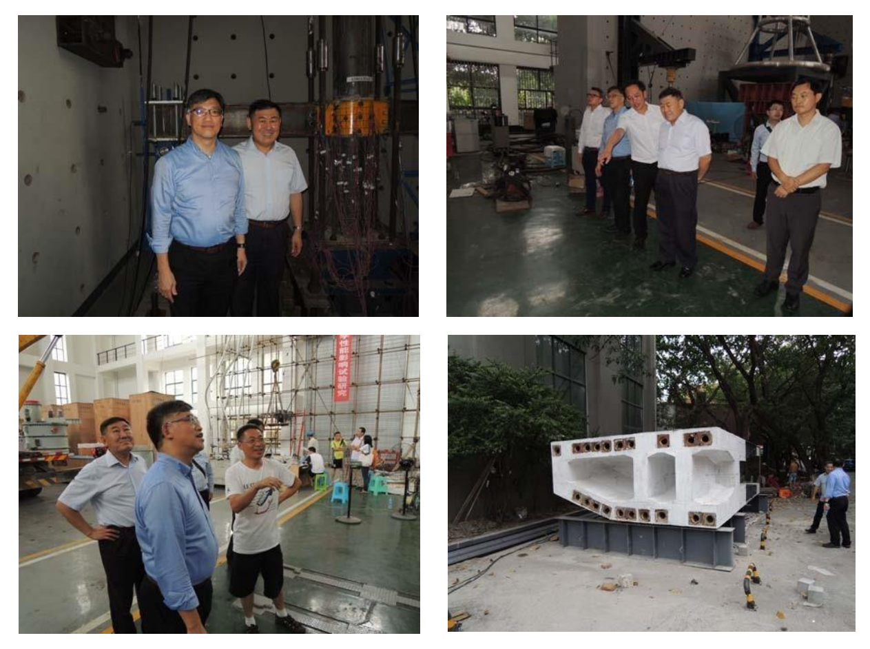
Delegation team at the Experimental Center of Civil Engineering.