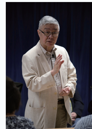
資深粵劇表演藝術家阮兆輝先生 Eminent Cantonese Opera Artist Mr Yuen Siu-fai