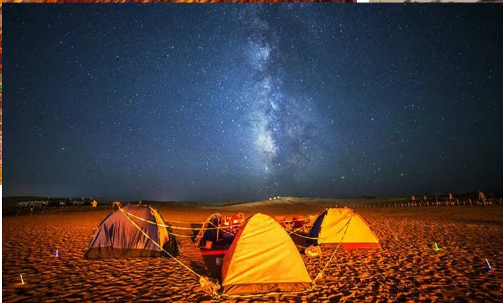
Camping in Dunhuang