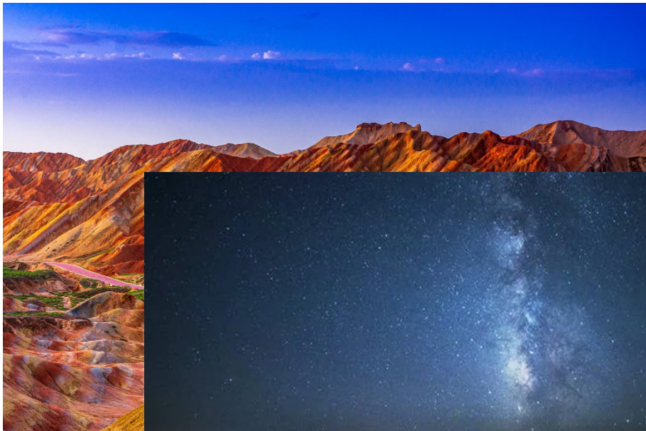
Zhangye Danxia Landform Geological Park