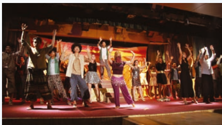
Students and instructors at the Camp make a successful performance.