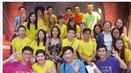
International volunteer instructors and PolyU Student Facilitators at the closing ceremony of the 2014 summer camp.