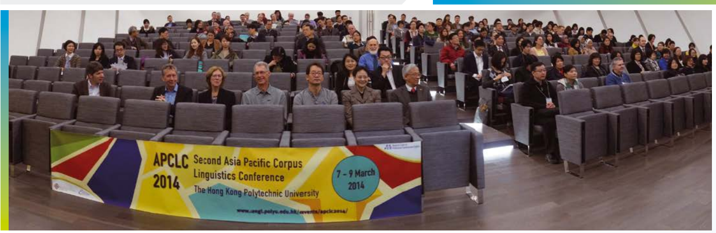
Participants of the conference