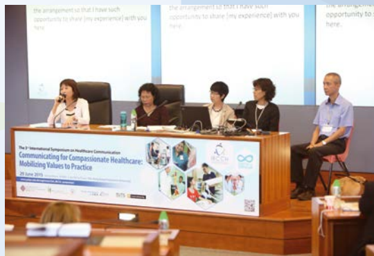
A panel discussion about patient experience is held during the Symposium and representatives from patients' organisations are invited to share their views.