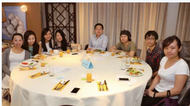
The great food and prizes bring lots of happiness but the most valuable part is meeting and talking with friends and teachers.

The Department of English Alumni Association (DEAA) organised an Alumni Reunion Dinner under the theme of 'Eat, Drink and Be Merry'. About 50 alumni and academic staff joined this occasion and they were glad to catch up with their previous classmates and teachers. The Alumni Affairs and Development Office (AADO) has also sponsored prizes for the game and lucky draw sessions which brought additional joy to all the participants. This is the first event organised by the new DEAA executive committee. They have also planned another alumni talk to be held before the end of 2015.