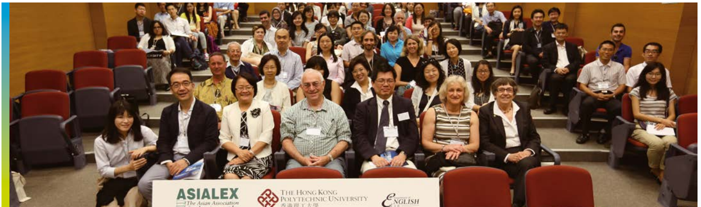
Participants of the conference