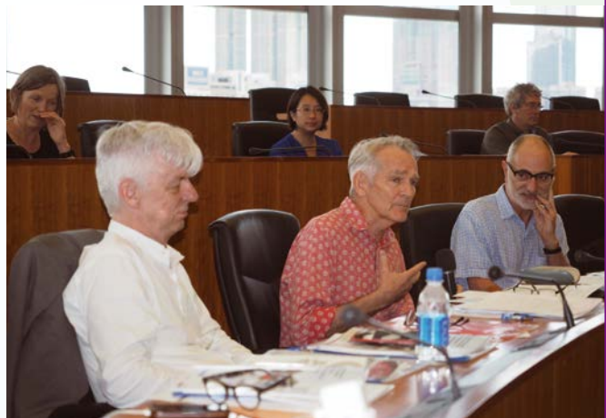
During the two-day Roundtable, IRCCH members actively discuss potential research opportunities in view of different situations around the world.