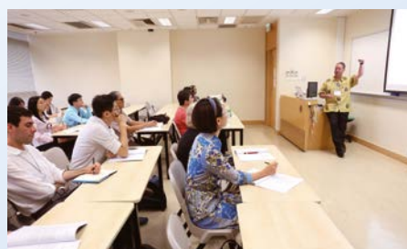
One of the parallel presentation sessions