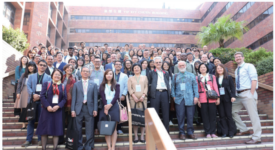
Participants of the symposium

Teaching English in higher education will continue to be important in the globalised era because of the dominant use of the English language in global industries. This symposium has become a regular platform for language educators and researchers around the world to exchange information and explore ways of improving language education. More information on this symposium can be found at https://www.polyu.edu.hk/engl/event/11thISTE TL .