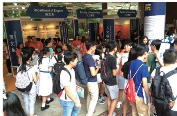
Colleagues and our student ambassadors promote our programmes to our booth's visitors and answer their queries.

About 30 staff and students of the Department took part in this annual University-wide event to promote our academic programmes to the visitors. There were exhibition panels at our booth to allow visitors to learn more about our programmes. In addition, our student ambassadors shared their university life with prospective students and parents. During the three info seminars for our BA (Hons) in English Studies for the Professions (BAESP) programme, two current BAESP students talked about their study, exchange, and work placement experience in the programme, which the participants found very useful and practical. The event attracted over 35,000 visitors to the PolyU campus.