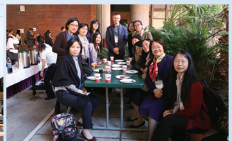
A good networking opportunity for participants of Tsinghua University and the Department during the refreshment break