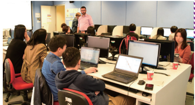
The Discursis workshop allows participants to obtain practical skills on using the software for health research.