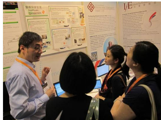
A member of the RFID Solutions Laboratory explains the “RFID-based Drug Management System” to the visitors.