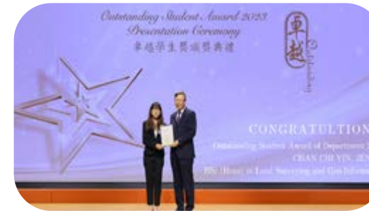
2023 Outstanding Student Awardee