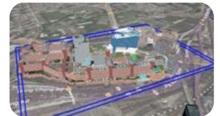
3D Model of PolyU

主修土地測量及地理資訊學(榮譽)理學士學位課程的學生另可申請第二主修「人工智能及數據分析(AIDA)」，該課程包括跨學科的學習，旨在為學生提供的地球科學、程式設計、統計學、數學等基礎，以致應用於大數據、人工智能及智慧城市相關應用的進階學習，培養具備新興科技解難技術的畢業生。