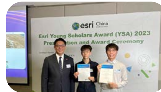
Awardees in ESRI Young Scholars Award 2023