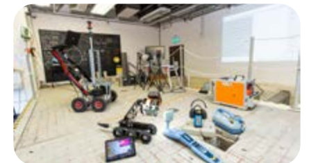
Instrumentation in Underground Utility Survey Lab

二) 於2024/25年推出的「城市信息學及智慧城市(榮譽)理學士」課程旨在裝備學生應對數據發展和快速城市化所迎來的挑戰與機遇。該課程包括城市科學原理和理論的學習，以及城市和空間數據分析的應用。讓學生掌握物聯網、雲端計算、城市大數據和人工智能等新興技術，並應用於建設智慧城市中不同的難題及優化項目。課程已獲香港測量師學會認證，並正在申請其他本地及國際的專業認可。