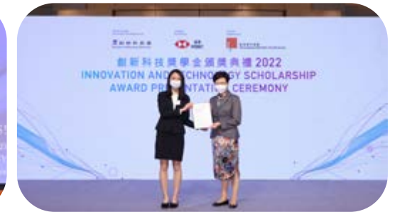
Innovation and Technology Scholarship Award 2022