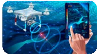
Data acquisition by UAV

1. The BSc (Hons) in Land Surveying and Geo-Informatics programme is the only local bachelor's degree programme in land surveying and geo-informatics accredited by the Hong Kong Institute of Surveyors (HKIS), the Royal Institute of Chartered Surveyors (RICS) and other related local/international professional bodies. The major study directions include: