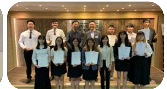
Awardees in HKIS Scholarship and Dissertation Awards in 2023