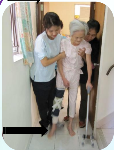
社區物理治療 Community-based Physiotherapy