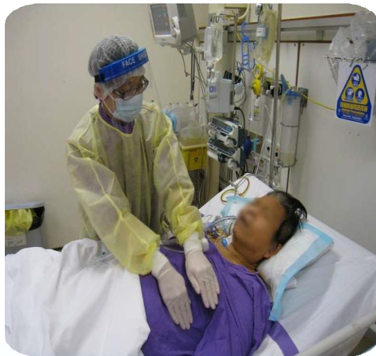
早期床旁康復 Early Bedside Rehabilitation