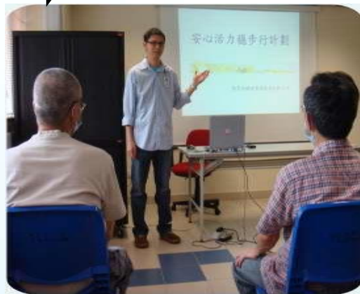
基層護理 Primary Healthcare