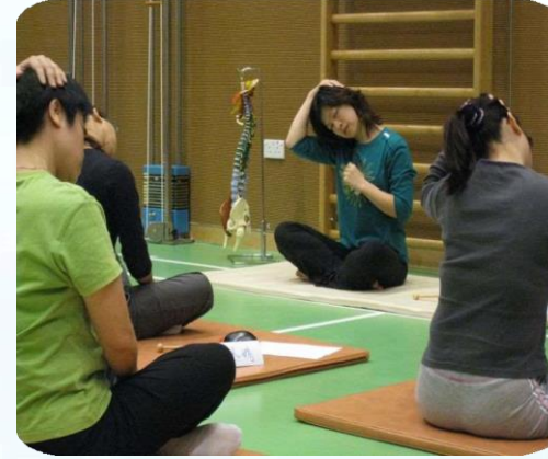
公眾教育 Public Education