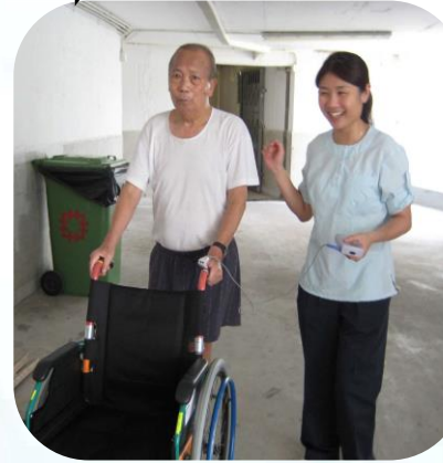
及早支持出院計劃 Discharge Planning 及 Early Support