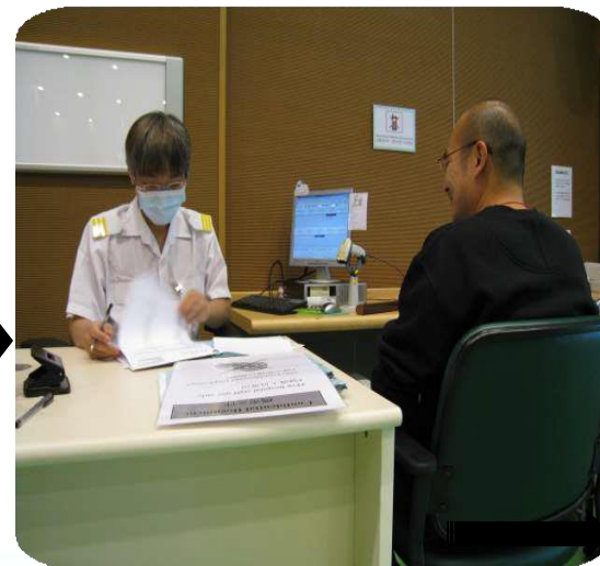
門診物理治療 Out-patient Clinic service