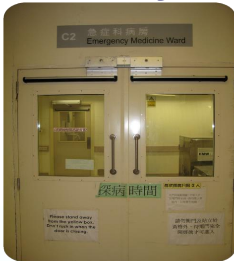
急症處理 Emergency Treatment