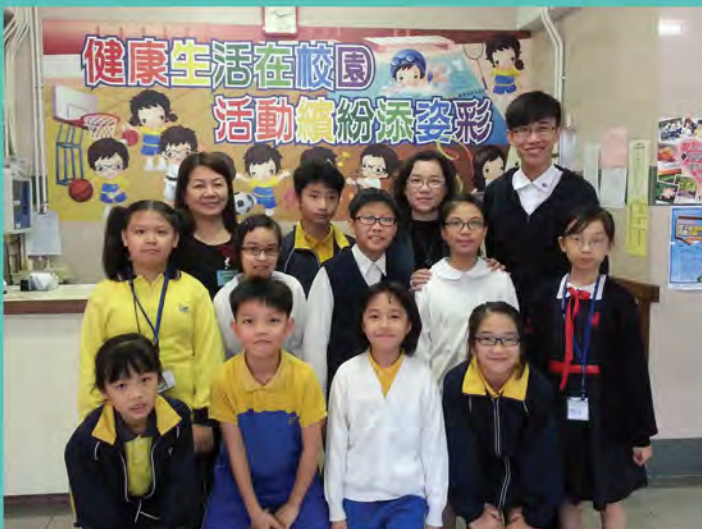
Project Name: A mentorship programme to help primary school students becoming health ambassadors 推廣健康，樹立榜樣 - 小學生兵團培訓暨伙伴計劃

新科實業有限公司繼續於2012-13 學年捐港幣十五萬設立「TDK-SAE 創新服務學習基金」，旨在鼓勵及資助理大學生組織服務學習的小組項目，從中培育同學的領導技巧及社會責任感；讓同學能學以致用、服務社會有需要人士；為他們提供持續的學習經驗，並幫助學生有持續的個人成長。今年的十四項申請中，共有六項成功獲得資助。