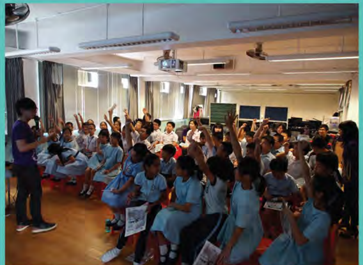
Project Name: Disaster preparedness: Training the trainer program 災難準備：培訓者培訓計劃