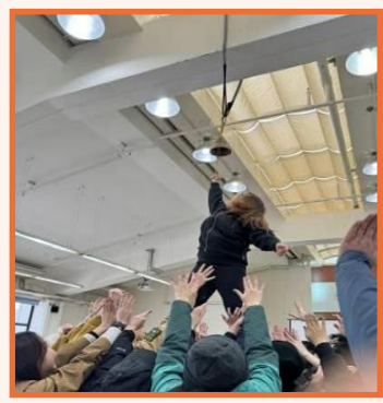
We rang the bell and won. Good teamwork!

Strong leadership was a must for navigation to be worked out in the 'boat' sailing.