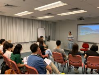
▲ (Music-with-Movement Intervention Workshop).

More than 150 visitors participated in the open day of the School's Integrative Health Clinic (IHC) on 24-25 May. Nursing students provided free health checks and health seminars were delivered. The Centre also organised the Youth Mental Health First Aid Course and the Music-with-Movement Intervention Workshop for People with Cognitive Impairment.