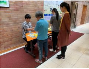
▲ (Free health checks on IHC's open day).