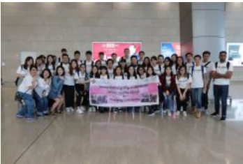
▲ Cambodia service learning team (25/5-12/6).