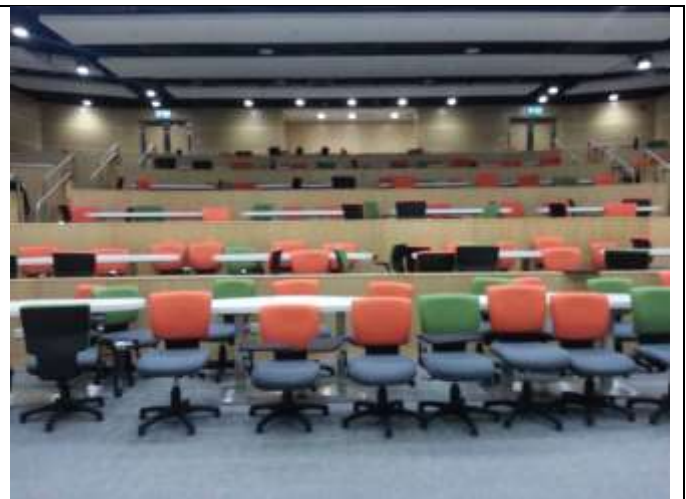
TU201 viewed from the front