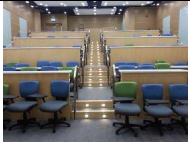
TU103 viewed from the front