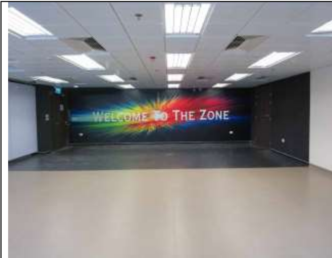
The Zone for multi-media and collaborative learning

will be run in Oct-Dec. The MoCoW learning stations will be opened for students' use in Semester 2.