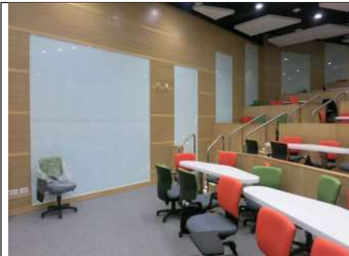
Writing glass panels on side walls