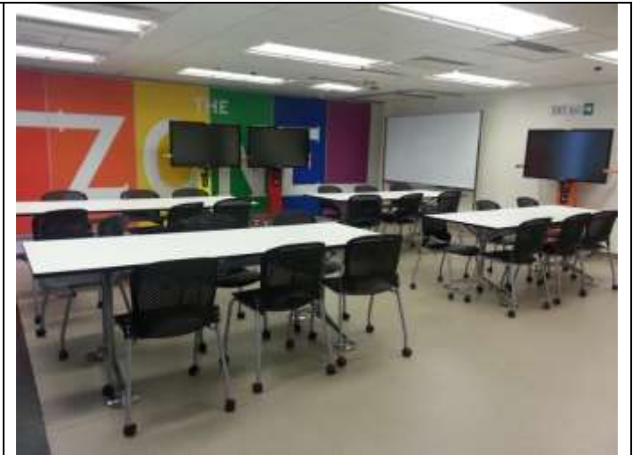
The Zone for multi-media and collaborative learning