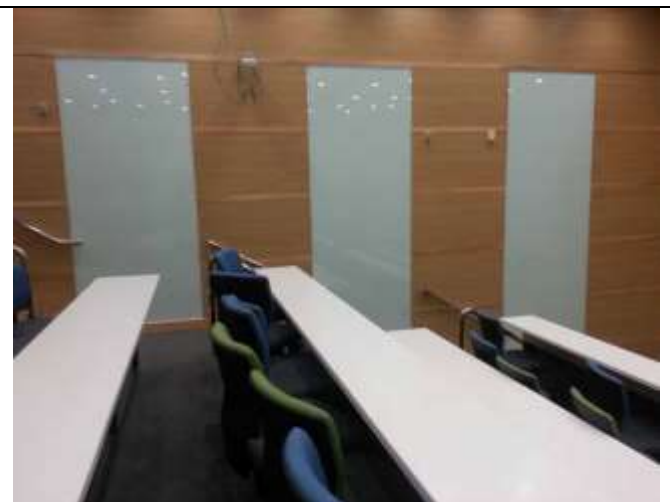
Writing glass panels on side walls