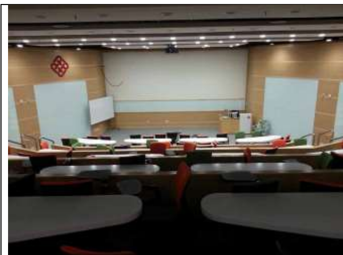
TU201 viewed from the back