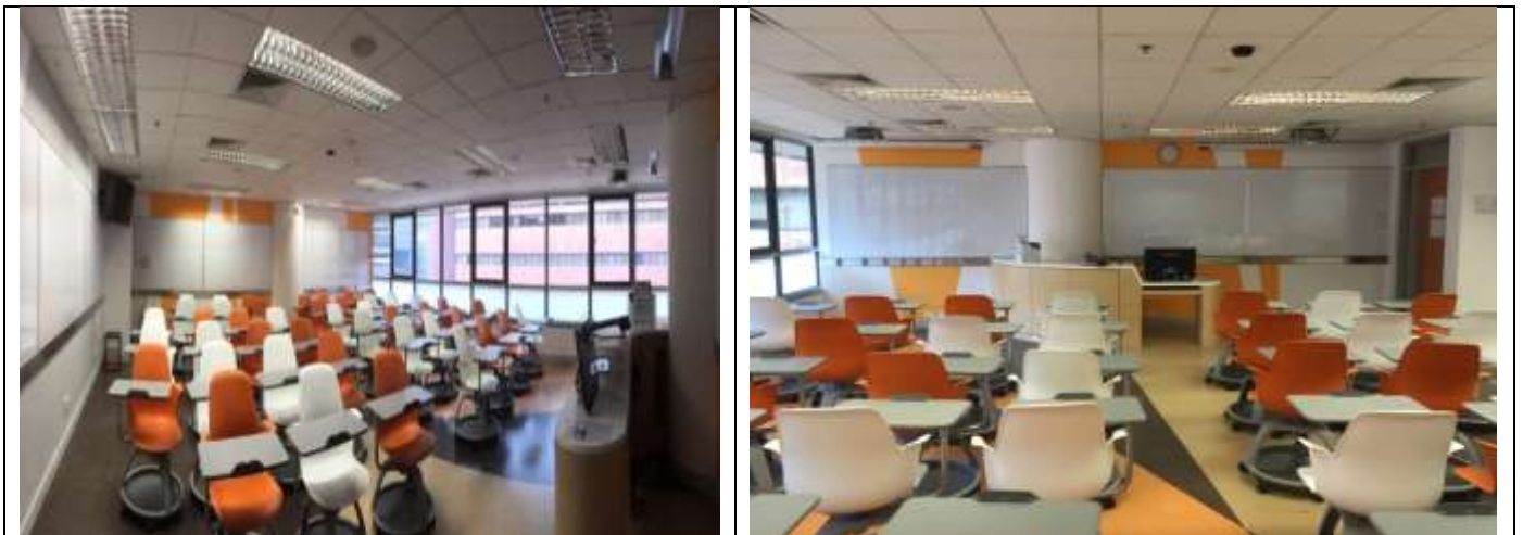
New nodal chairs

QR611 was transformed from a computer laboratory into a 45 capacity General Teaching room which features with a new look and more modern facilities and furniture. The upgraded room has been used for a year, and a user survey (staff and students) was performed twice. Feedback indicated the chairs were not so comfortable. In response, a new-style nodal chairs (in orange and white) which are highly mobile and more comfortable replaced them in summer 2015.