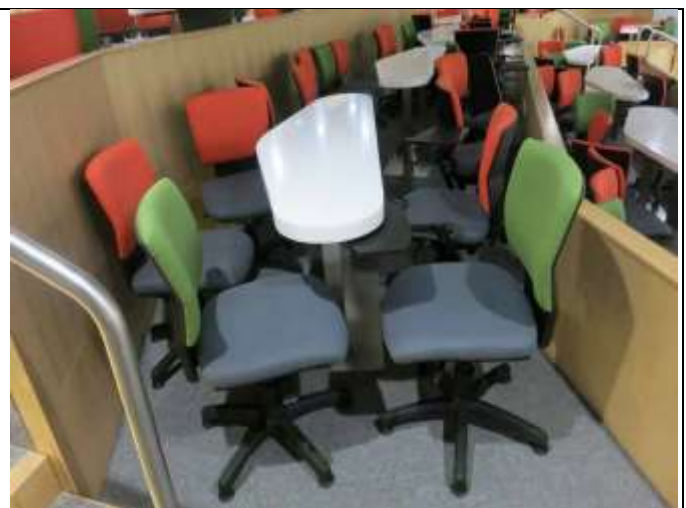
Double layers swirl seating