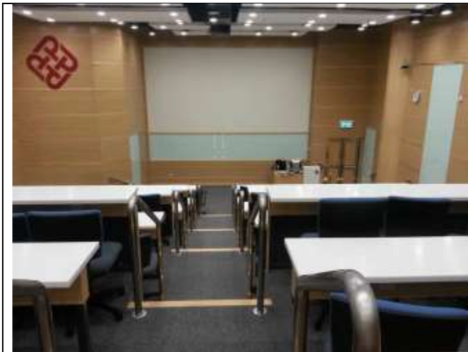
TU103 viewed from the back